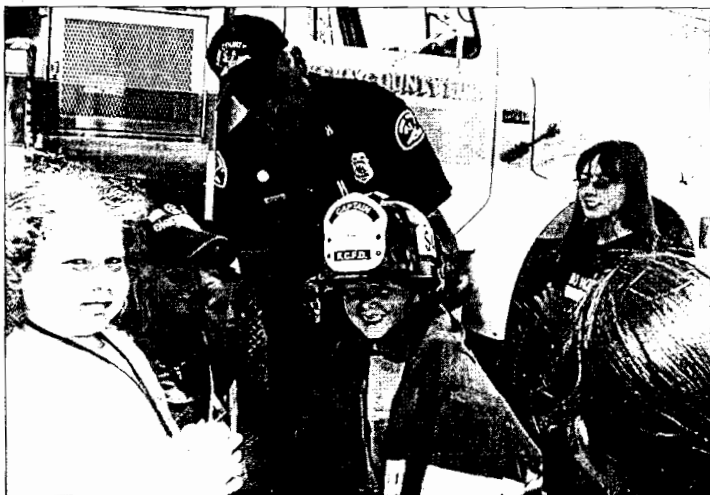
"How do I look?" One of the best things any young person can do is try on all that "stuff" a fireman wears.