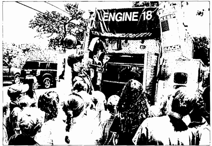
An Emergency Preparedness afternoon was part of the recent PAL-Day Camp. Pictured here are the campers as they listen to one of the firemen from Stallion's Station 18 explaining the pieces of fire equipment used in an emergency.